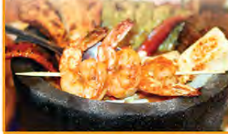
EL MOLCAJETE 26.99 Grilled steak, chicken, shrimp, and Mexican sausage served in a traditional stone bowl with fresh fried cheese and tortilla soup, yellow rice, refried beans and your choice of corn or flour tortillas.