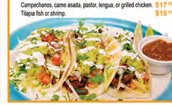
HERRADURA LOADED TACOS Your choice of three tacos served on flour tortillas topped with shredded lettuce, guacamole, Pico de Gallo and sour cream. Served with yellow rice and refried beans. Ground beef picadillo, carnitas, shredded chicken, or chorizo $16.99 Campechanos, carne asada, pastor, lengua, or grilled chicken $17.99 Tilapia fish or shrimp $18.99

La Herradura is not a gluten-free restaurant. Products containing gluten are prepared in our kitchens. Please inform your server of your gluten sensitivity. * CONSUMING RAW OR UNDERCOOKED MEATS, POULTRY, SEAFOOD, SHELLFISH OR EGGS MAY INCREASE YOUR RISK OF FOODBORNE ILLNESS, ESPECIALLY IF YOU HAVE CERTAIN MEDICAL CONDITIONS. PARTY OF 6 OR MORE 18% GRATUITY WILL BE ADDED TO YOUR CHECK