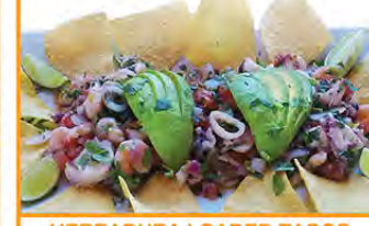
CEVICHE MIXTO * 25.99 Cooked Shrimp, octopus, and calamari marinated in lime juice, mixed with tomatoes, red onions, jalapenos, avocado and cilantro.