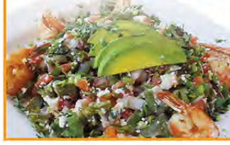
ENSALADA DE NOPALES Grilled cactus with pico de gallo served on a bed of salad blend and topped with queso fresco. Chicken 12.99 Shrimp 14.99