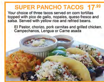
SUPER PANCHO TACOS 17.99 Your choice of three tacos served on corn tortillas topped with pico de gallo, nopales, queso fresco and salsa. Served with yellow rice and refried beans. El Pastor, chorizo, pork carnitas and grilled chicken, Campechanos, Lengua or Carne asada