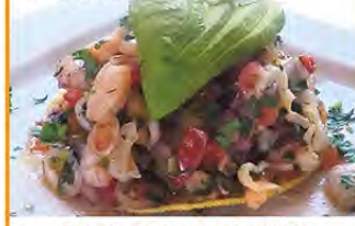
CEVICHE SUPREME * 14.99 Calamari rings, octopus, and shrimp, marinated and mixed with red onions, tomatoes, avocado, and cilantro served on a homemade corn tostada.