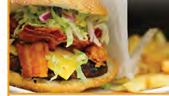
BACON AND EGG BURGER 14.99 1/2 lb Burger served with mayo, bacon, cheese, lettuce, tomatoes, and topped with a fried egg.